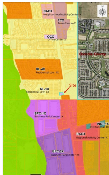
Proposed Future Land Use Map