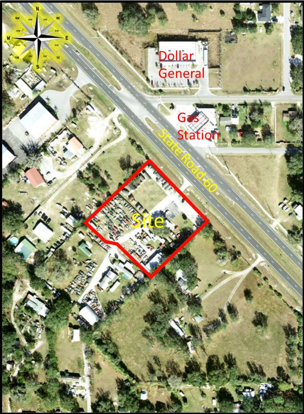
2023 AERIAL PHOTO CLOSE UP