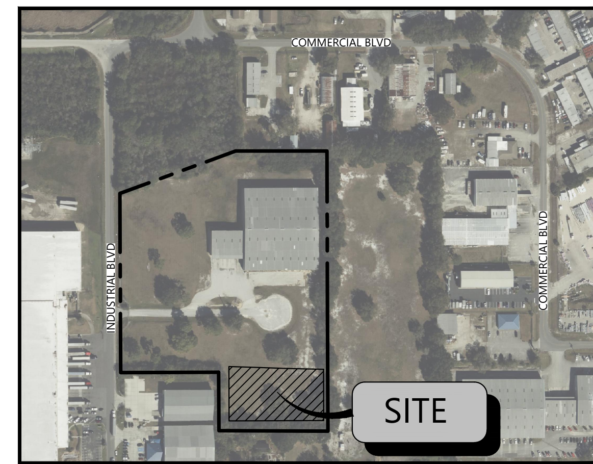
AERIAL MAP N.T.S.

NOTE: BASED ON GRAPHIC DETERMINATION, THIS PROPERTY DOES LIE IN A F.E.M.A./F.I.R.M. SPECIAL FLOOD HAZARD AREA PER COMMUNITY PANEL NO. NUMBER DATED DATE.