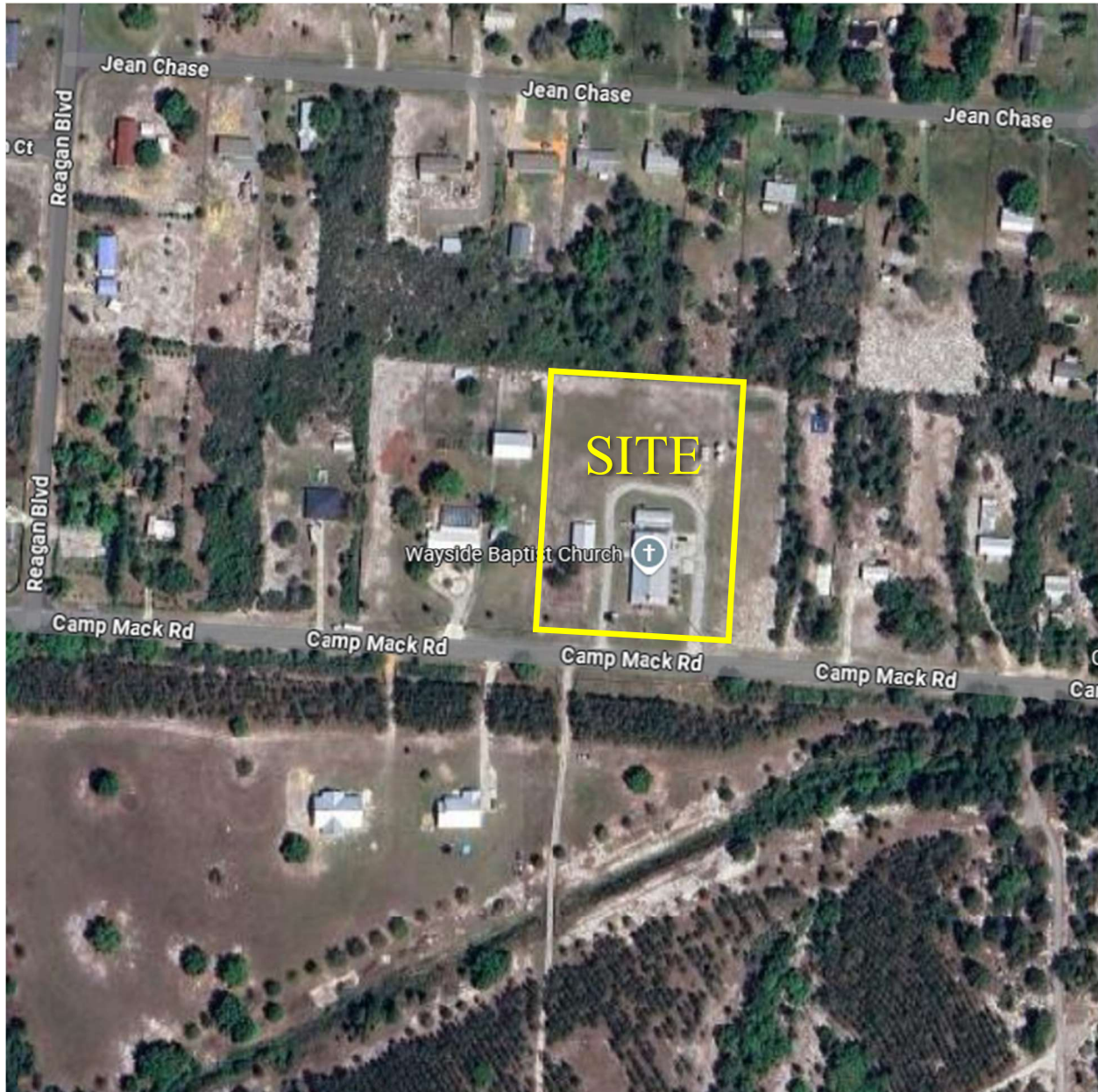
Exhibit 2: Aerial Photo of Site

Project: Wayside Baptist Church Expansion Site Boundary: See Legal Description Provided Parcel ID #s: 292930-991750-002090 Acreage: +/- 2.95 acres