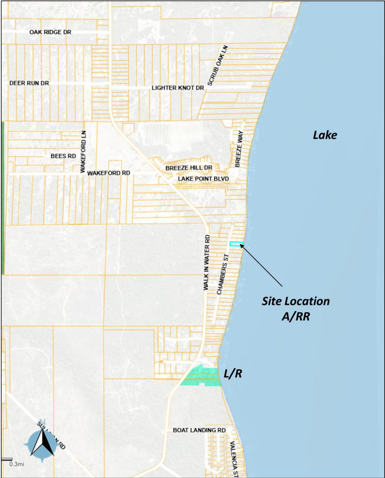
Future Land Use Map