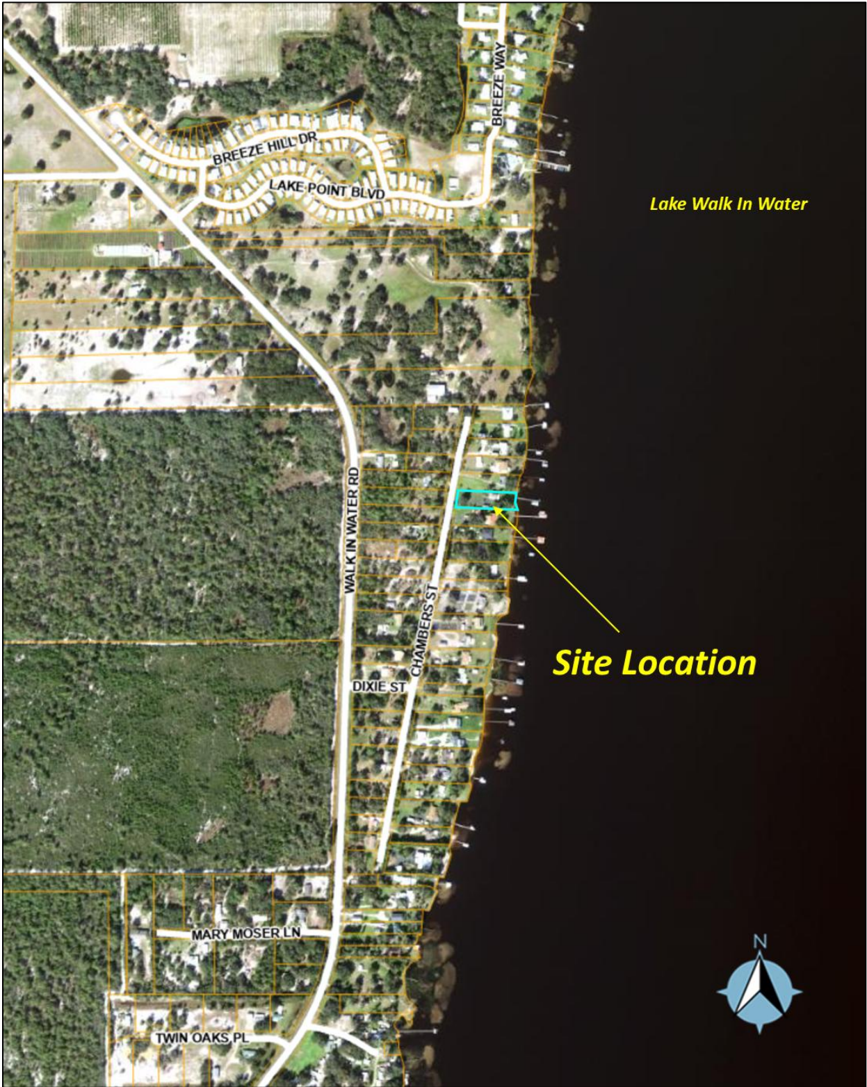
Aerial Image – Context