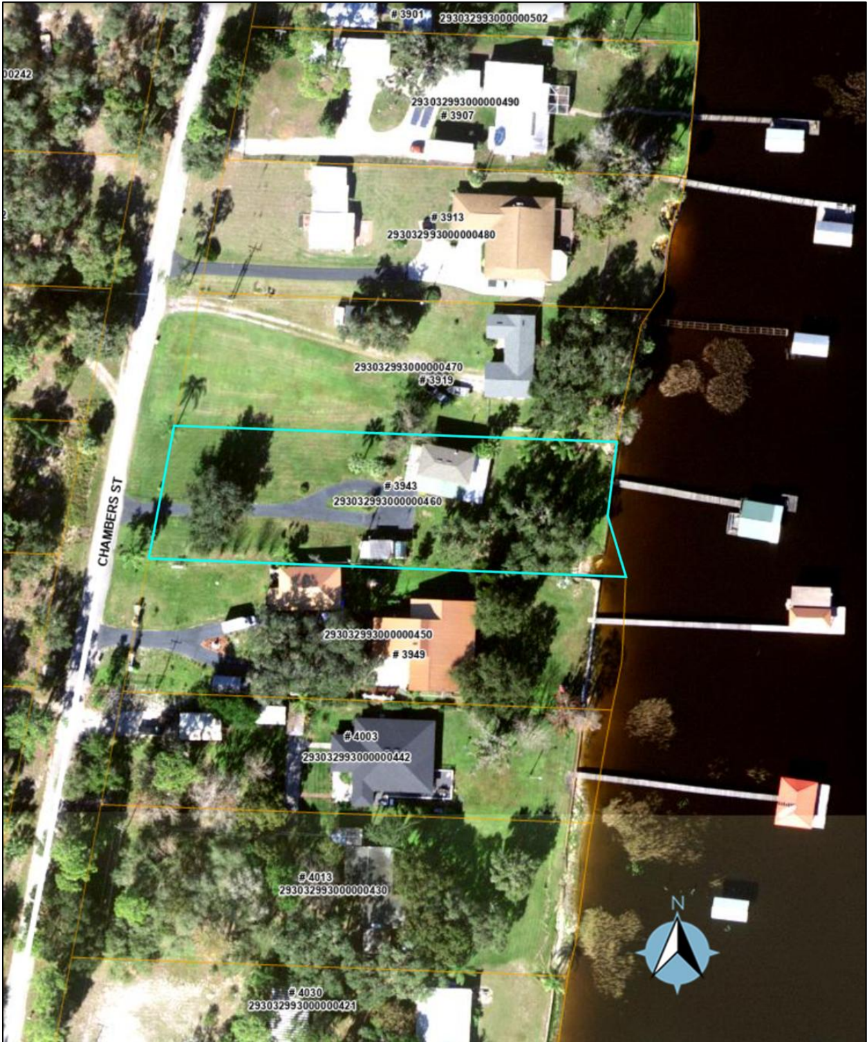
Aerial Image – Close