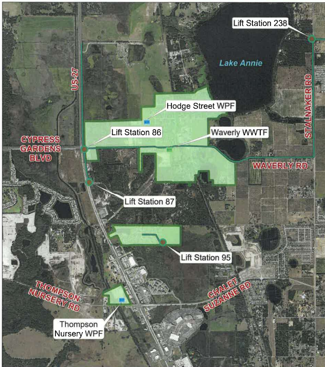
Exhibit D - Waverly Service Territory