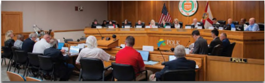
Polk TPO Board Meeting