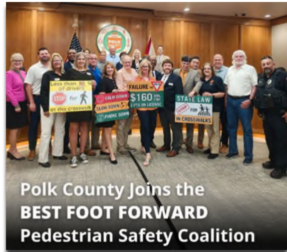
Polk TPO Board Meeting – June 12, 2025

Best Foot Forward – The Polk TPO has formalized their participation with the Best Foot Forward program. In partnership with FDOT, Best Foot Forward compliments the TPO’s Vision Zero Polk efforts and is aimed at protecting and educating the community through its crosswalk enforcement initiative. Prior to the start of school in August, several pedestrian crosswalks in Bartow, Lakeland and Winter Haven were targeted and law enforcement officers stopped drivers that did not yield to pedestrians and educated them on the Florida law which gives pedestrians the right of way once they enter a marked crosswalk. The TPO will continue to support Best Foot Forward in the coming years.