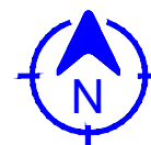
Figure #2 Gopher Tortoise Survey Gopher Tortoise Relocation

ChampionsGate 6236 Ronald Reagan Parkway Davenport, Florida 33896