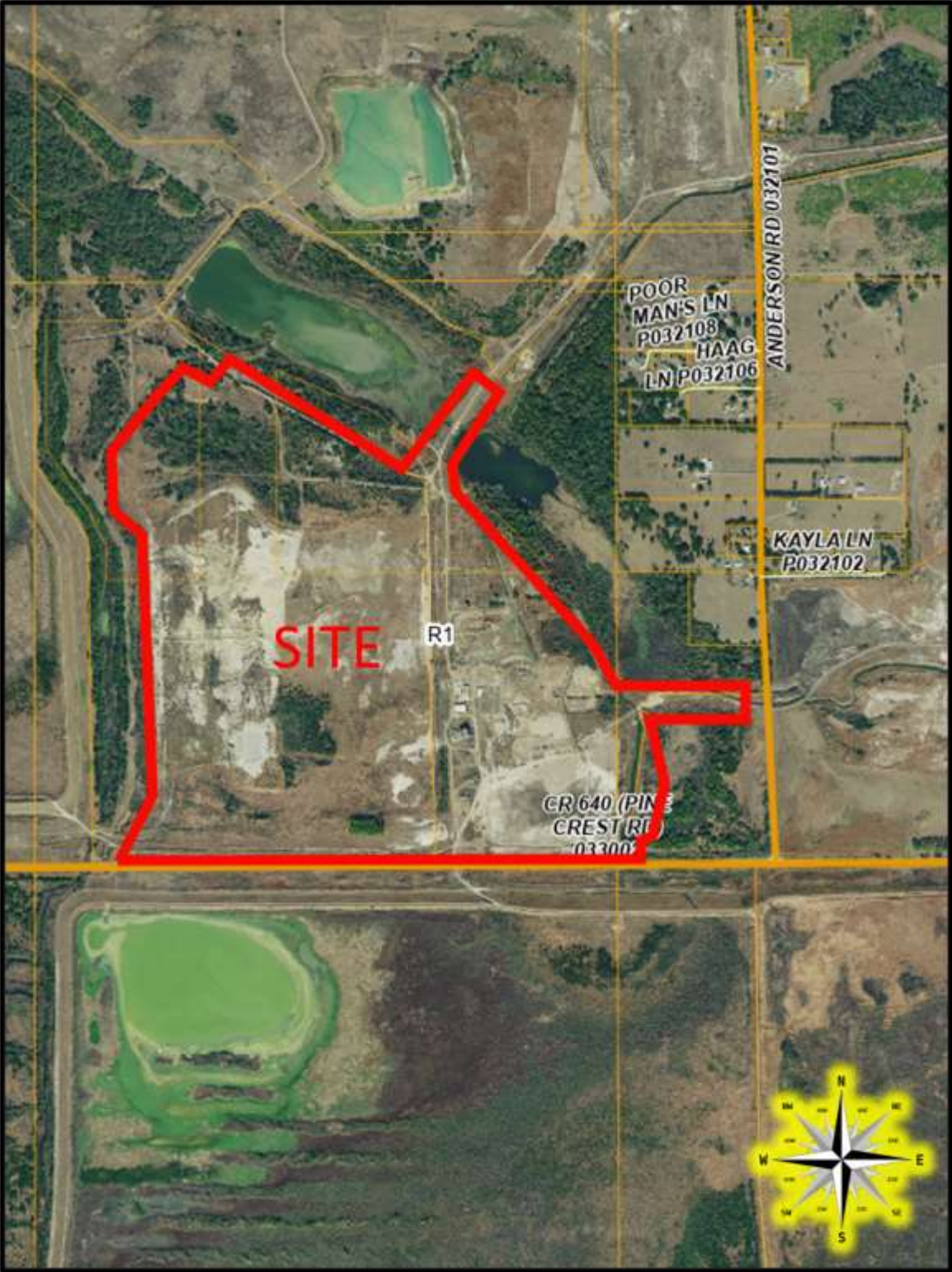
2023 AERIAL PHOTO CLOSE UP