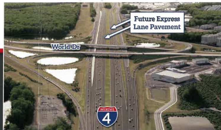
Improvements at the I-4 and World Drive Interchange