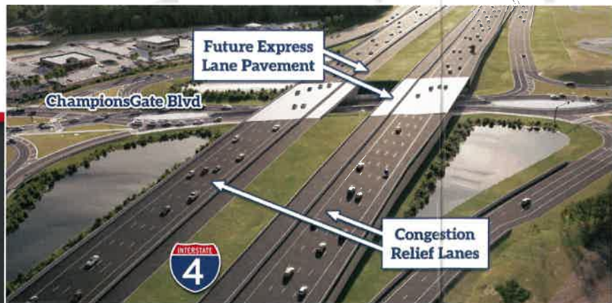
Improvements at the I-4 and County Road 532 (ChampionsGate Blvd) Interchange