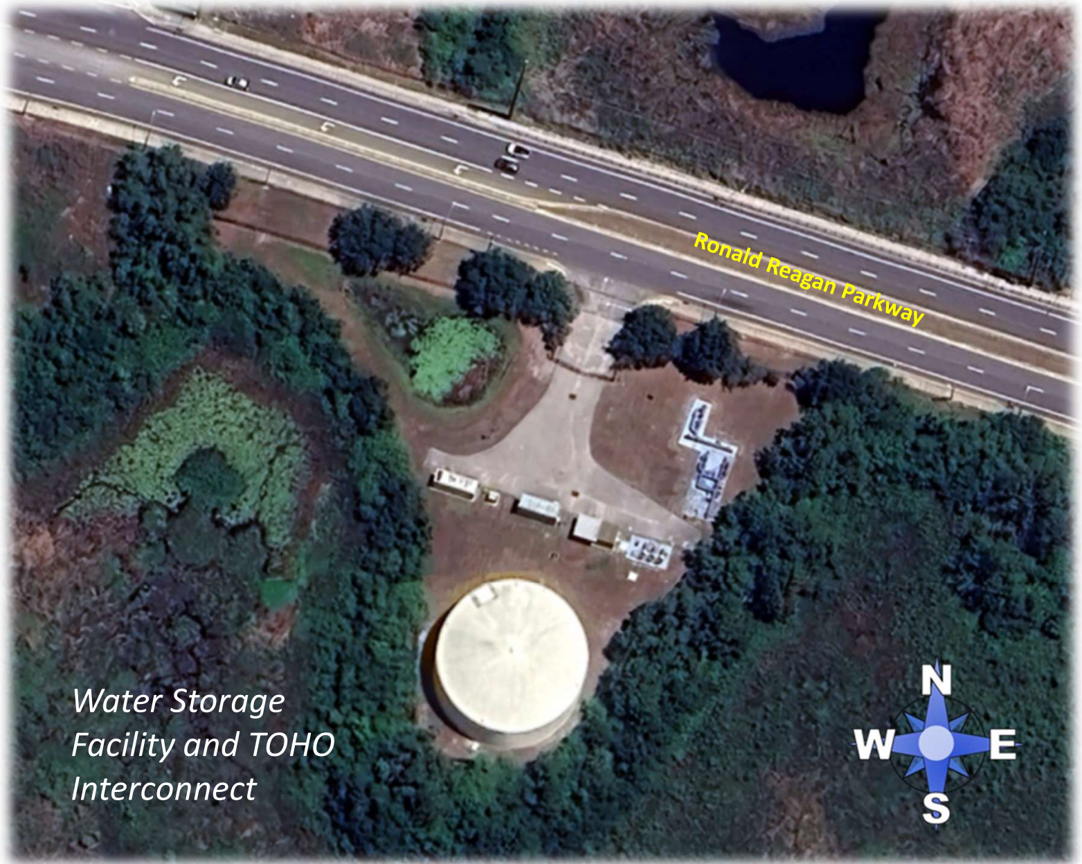
Water Storage Facility and TOHO Interconnect