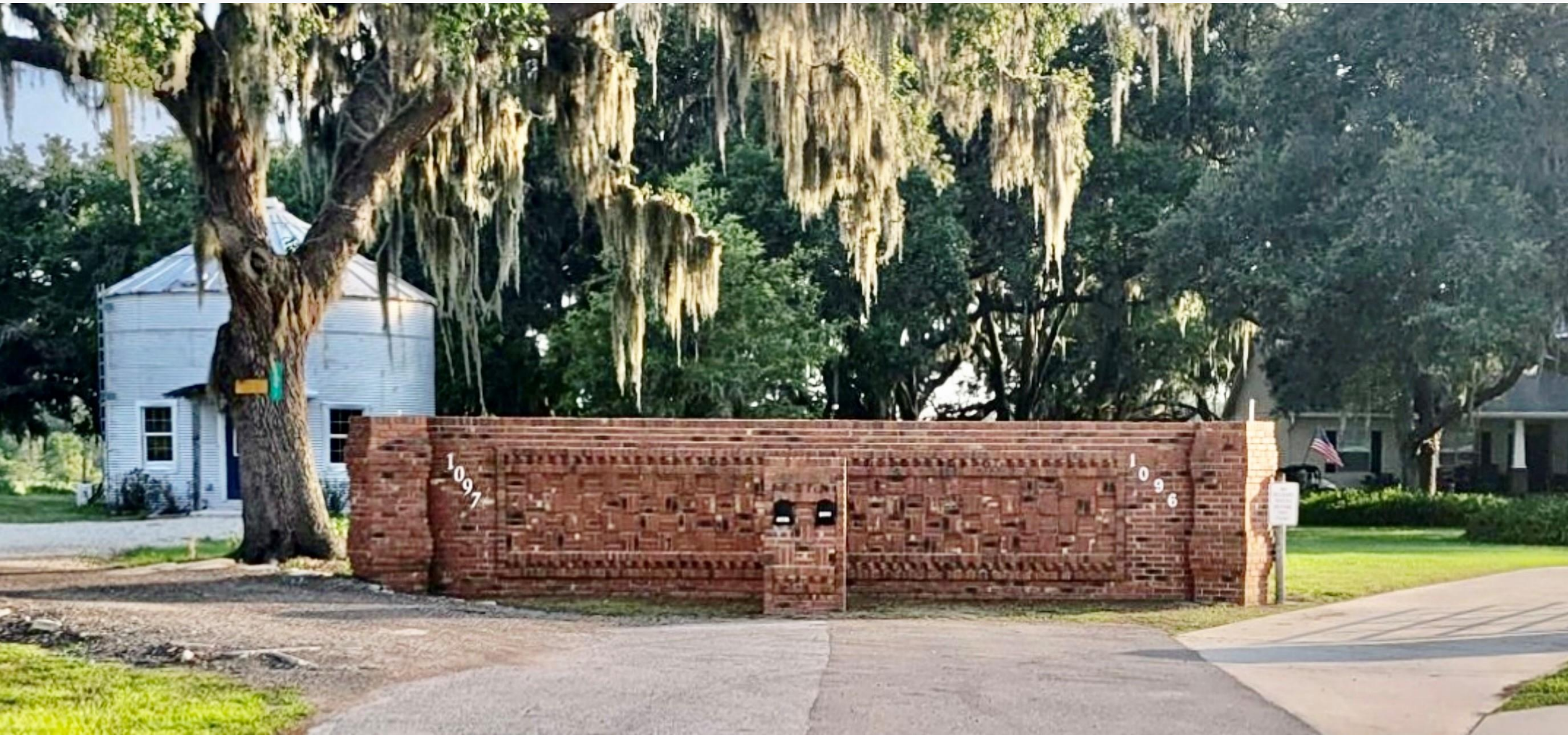
Our driveway on right.