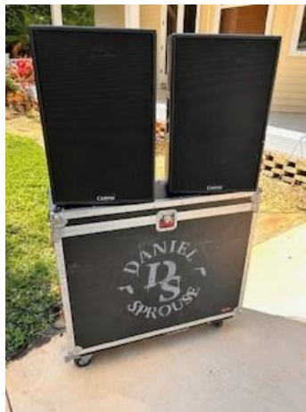
Figure 2: Sound equipment used for this testing.

Sound was recorded in 15-minute increments from ~10am – 1pm. First data was collected with the DJ not playing music to get background levels. Then the locations were repeated with the DJ playing music. The DJ was using two Carvin 1000 watt speakers model SCX15A with a Behringer X32 Digital Console (Figure 2). The DJ was playing representative music at typical levels for a wedding during the testing.