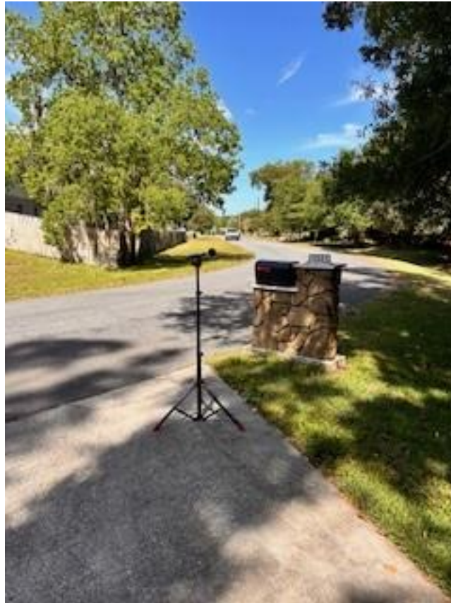
Figure 1: Sound level meter location at the west property line.

Sound was recorded in 15-minute increments from ~10am – 1pm. First data was collected with the DJ not playing music to get background levels. Then the locations were repeated with the DJ playing music. The DJ was using two Carvin 1000 watt speakers model SCX15A with a Behringer X32 Digital Console (Figure 2). The DJ was playing representative music at typical levels for a wedding during the testing.